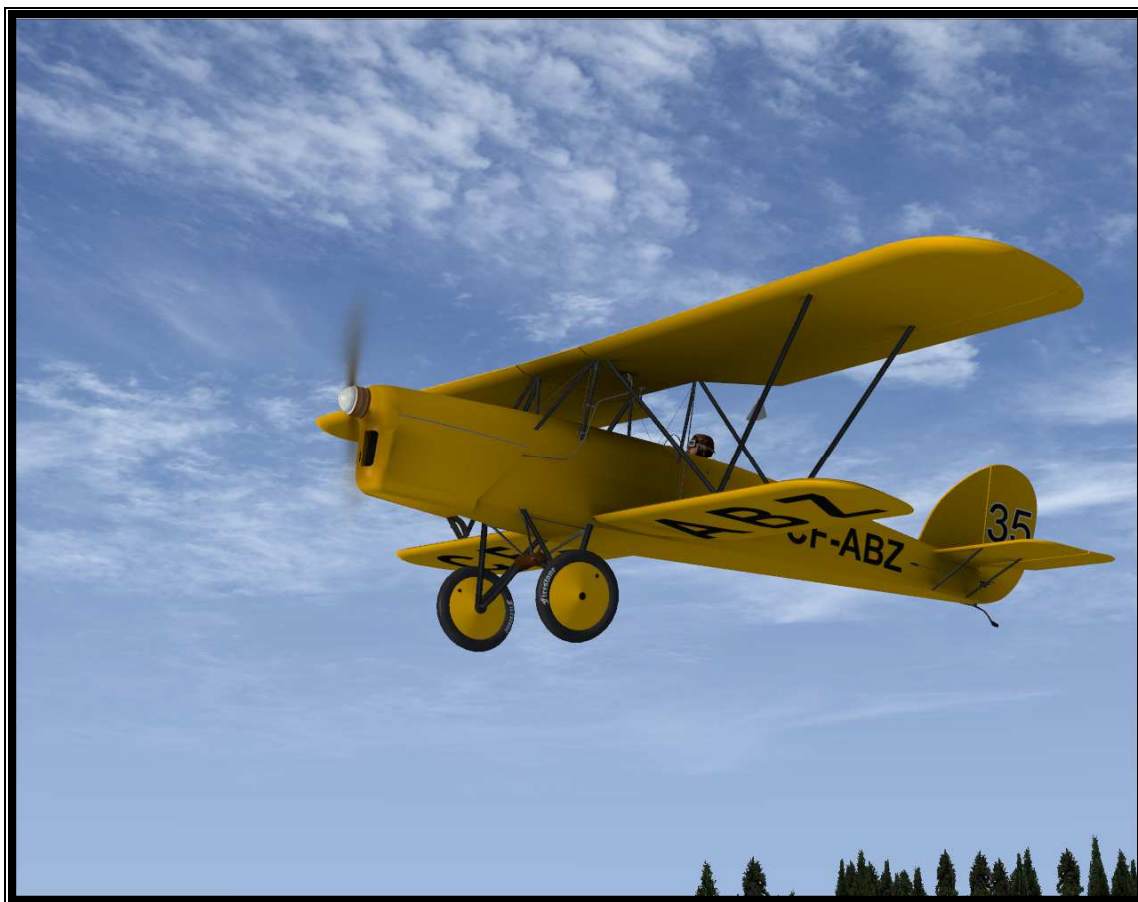
Curtiss-Reid Rambler III

http://en.wikipedia.org/wiki/Curtiss-Reid_Rambler