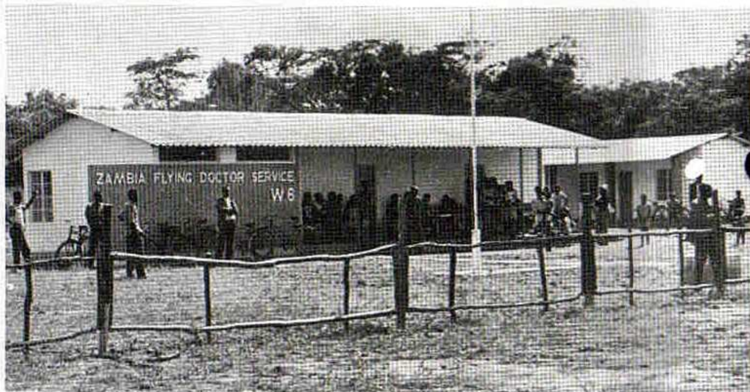
F.D.S. Clinic 1973 all future clinics will be built on similar plan