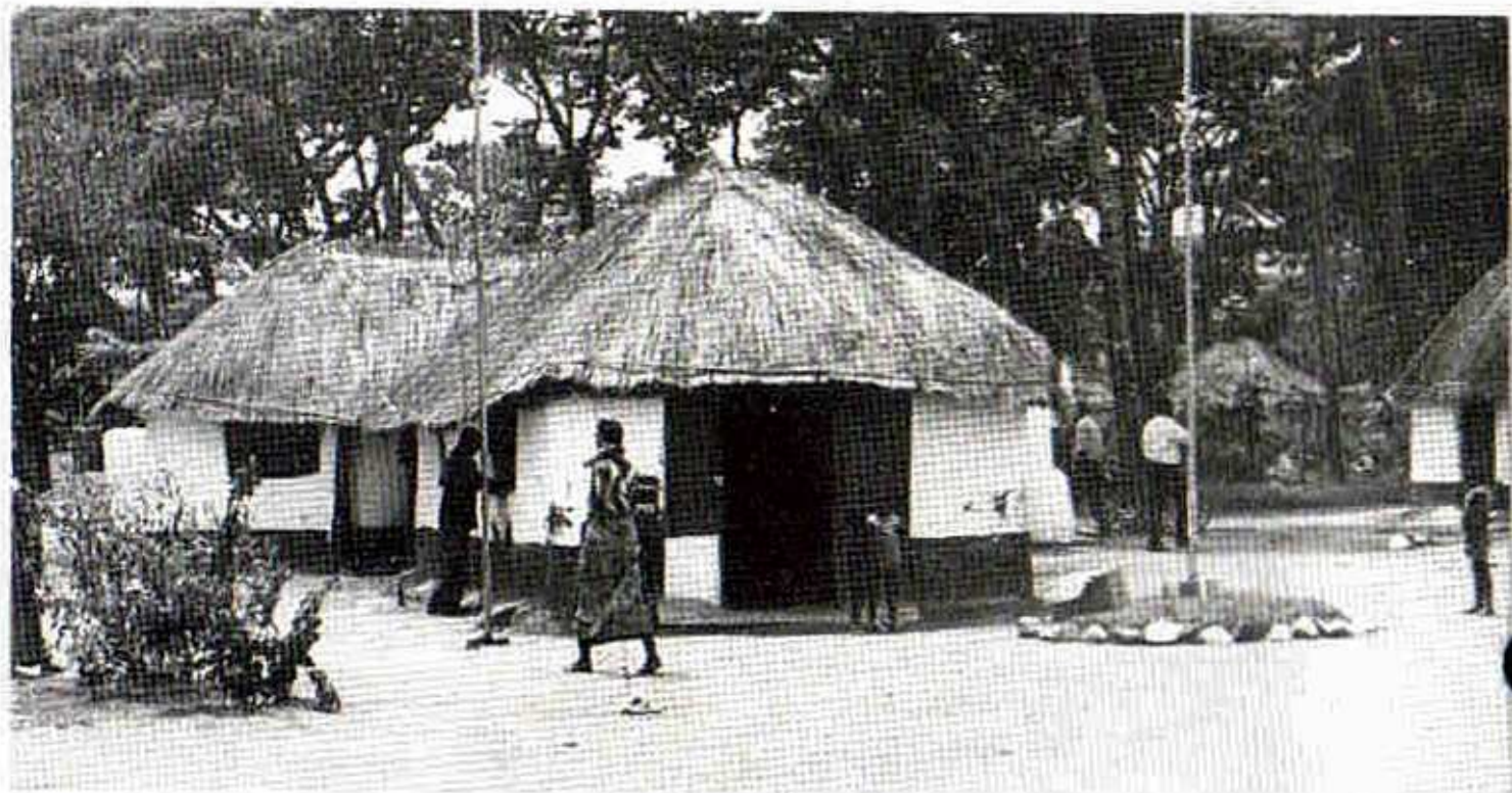
W 1 — First F.D.S. clinic 1965