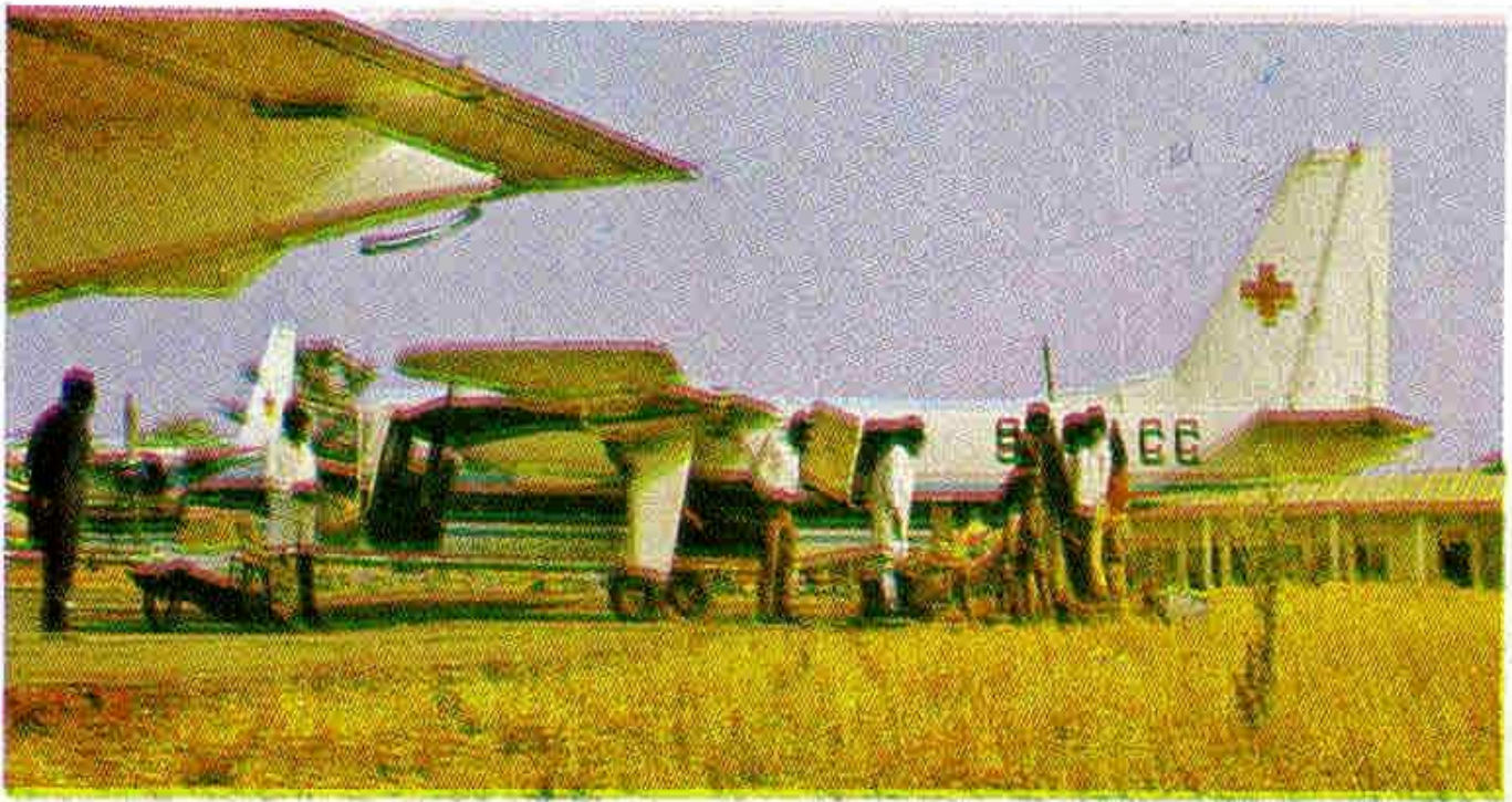
Freight being loaded at Ndola H/Q,s for Airstrip clinics